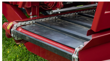
Chain & slat conveyor